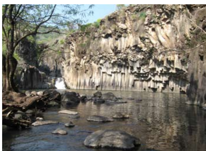
The Meshushim Pool