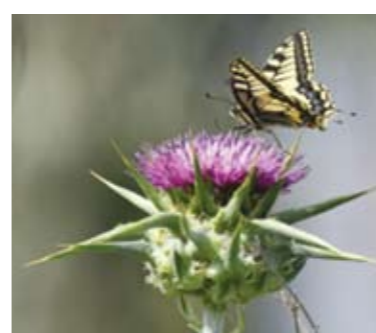
Common swallowtail butterfly