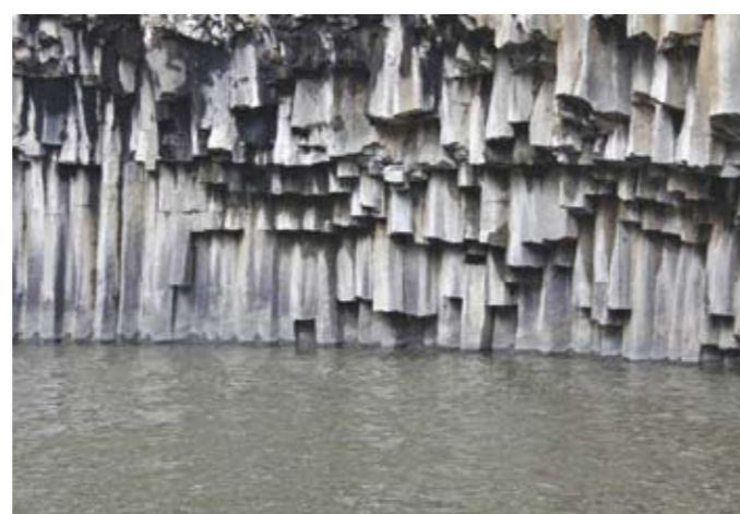
A view of the hexagons

Before you reach the edge of the pool, follow the red trail markings upstream toward a bridge with a view of the flowing stream and the pool. Do not continue past the bridge.