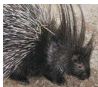
Indian crested porcupine

Pool – and Persian cyclamens ( Cyclamen persicum ) appear, flowering until February. At winter's end, Turban-buttercups ( Ranunculus asiaticus ) paint the slopes of the reserve red, accented by pink Egyptian honesty ( Ricotia lunaria ). The grandest of the reserve's flowers is the Hermon (Golan) iris ( Iris hermona ), whose two-tone blooms reign from February to April.